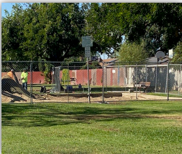
Frederick Douglas Park