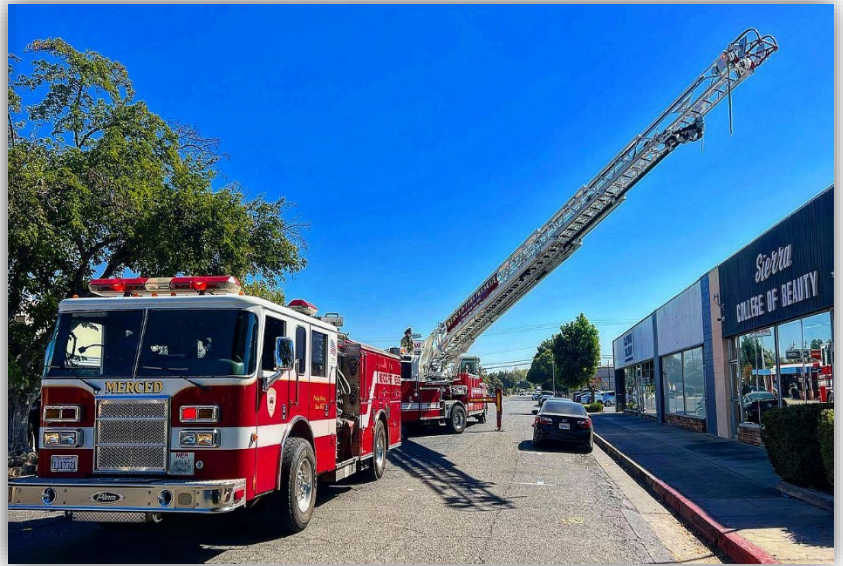
Engine 51 on Scene