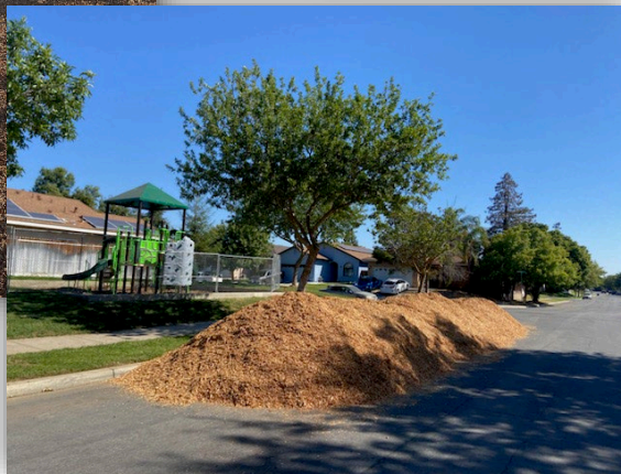
Frederick Douglas Park